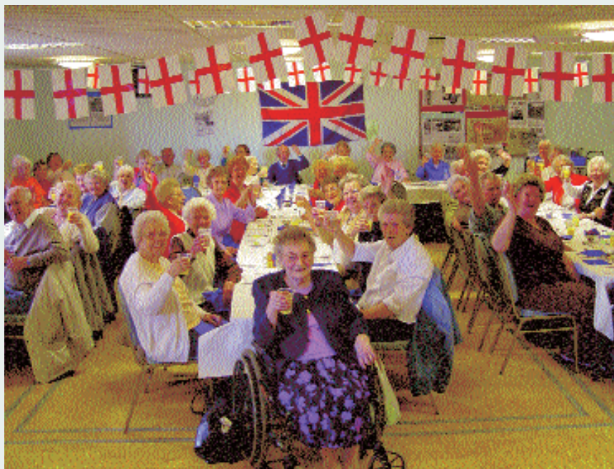
Horley's Regent House Community Centre attracted about 80 people to its special VE Day lunch with entertainment. The Albert Road premises include a drop in centre for the active 50 plus, and the special lunches are a feature of special occasions. Regular activities include tea dances, art club and the Regent rambles.