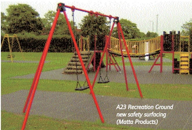
A23 Recreation Ground new safety surfacing (Matta Products)

Next year the council hopes to carry out extensive work at the Michael Crescent playground.